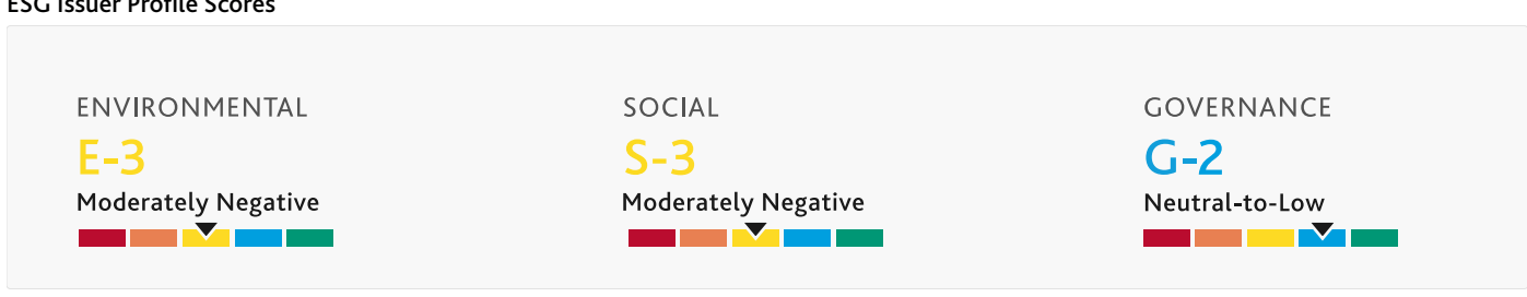
Exhibit 4 ESG Issuer Profile Scores

AFD's CIS-2 indicates that ESG considerations are not material to the rating. Social risks are limited at AFD given its development role as the only on-lender in Paraguay's financial system, focused on housing. Although AFD is part of the Government of Paraguay, governance risks are mitigated by adequate risk management and policies.